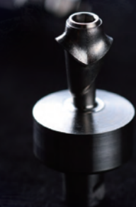
Titanium alloy* *The optional attachment is required.

With DGSHAPE genuine grinding burs (ZGB/ZGB2 series) and the bundled DGSHAPE CAM, the DWX-43W offers consistent, precise milling of dental applications. In addition, its stabilized frame enables high-quality milling of custom titanium abutments.