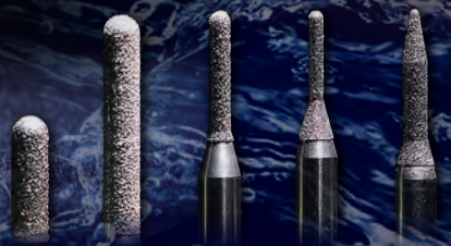
DGSHAPE genuine diamond-coated grinding burs