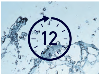
Auto-rinse every 12 hours