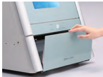
Tank cover folds flat for easier access