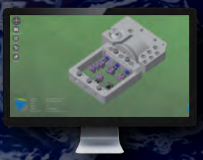
DGSHAPE CAM for DWX-43W