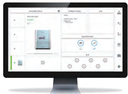
VPanel for DWX